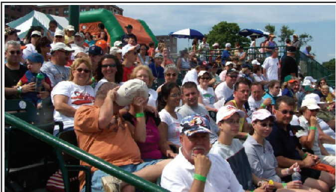
We had a strong turnout for the three Ducks games the Club attended.