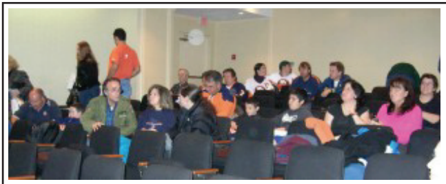
We had a good turnout for our first Booster Club meeting post lockout